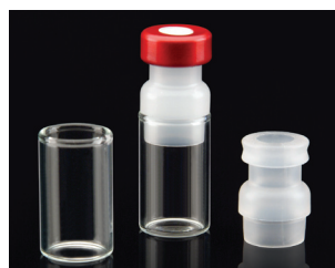
2.0mL Vista Vial™, 11mm Crimp