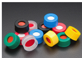
9mm R.A.M.™ Ribbed Cap

Preassembled closures and septa come ready to use. Designed to work in Agilent or other robotic arm autosamplers. Available in a variety of colors.