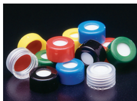
9mm R.A.M.™ Cap

Preassembled closures and septa come ready to use. Designed to work in Agilent or other robotic arm autosamplers. Available in a variety of colors.