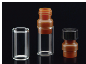
2.0mL Vista Vial™, 9mm Thread

Type I borosilicate glass. The tops are made of polyethylene and are available in a variety of neck finishes – 8-425mm thread, 9mm thread, 11mm crimp. The Vista Vial™ is easier to fill – the wide opening of the glass bottom facilitates direct pipetting and is ideal for viscous fluids such as detergents and oils. Depending on the sample, disposal of vials is easier as the plastic can be incinerated intact without the need for closure removal.